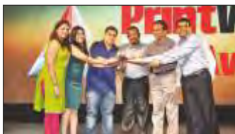
Print Week 2014 Awards: Direct Mail Printer of the Year