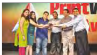
Print Week 2014 Awards: Direct Mail Printer of the Year